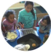
Ages 6-7 Years Primary