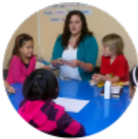
Ages 8-10 Years Primary