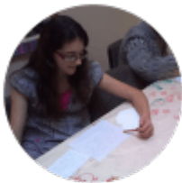
Ages 11-12 Years Pre-Teen