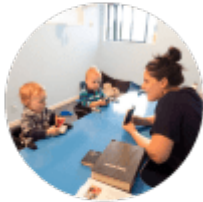
Ages 0-2 Years Infants-Toddlers