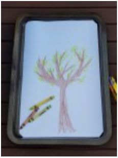
Draw a bush