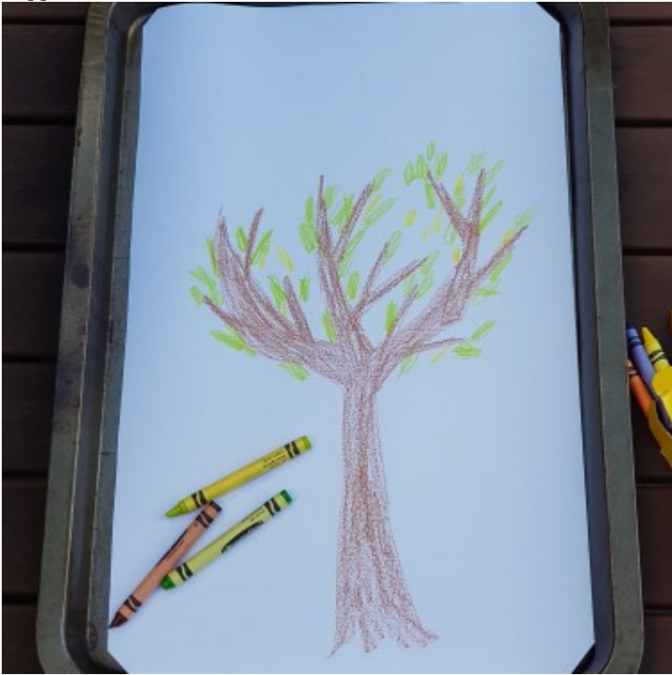
Draw a bush