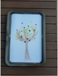
Add dots of paint