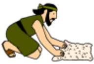
Gideon and the Fleece