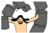
The Death of Samson