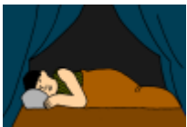
The Lord Speaks to Samuel