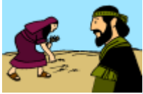
Ruth and Boaz