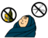
The Birth of Samson