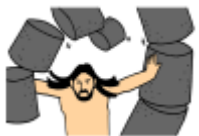
The Death of Samson