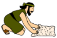
Gideon and the Fleece