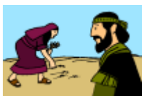
Ruth and Boaz