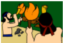
Gideon and the Midianites