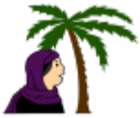
Deborah the Judge