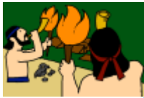
Gideon and the Midianites