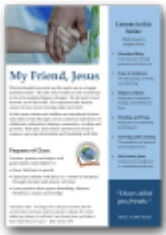
My Friend Jesus (6 Lessons)

Comfort, love and affection in a relationship with Jesus.