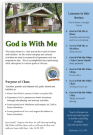
God is With Me (6 Lessons)

©Mission Bible Class 2011-2026. Before copying or reproducing any portion of this website, please carefully read the "Copyrights and Permissions Page." https://missionbibleclass.org/about/copyrights-and-permissions/ (Not to be sold or profited from in any way.) www.missionbibleclass.org