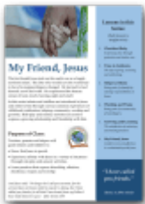
My Friend Jesus (6 Lessons)