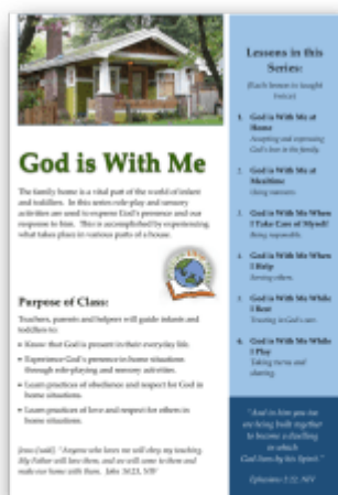
God is With Me (6 Lessons)

©Mission Bible Class 2011-2025. Before copying or reproducing any portion of this website, please carefully read the "Copyrights and Permissions Page." https://missionbibleclass.org/about/copyrights-and-permissions/ (Not to be sold or profited from in any way.) www.missionbibleclass.org