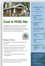
God is With Me (6 Lessons)