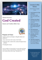
God Created (6 Lessons)