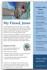
My Friend Jesus (6 Lessons)