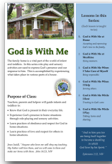
God is With Me (6 Lessons)