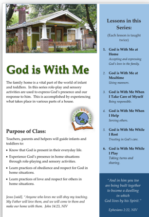
God is With Me (6 Lessons)

For more information see Mission Bible Class Copyright Conditions