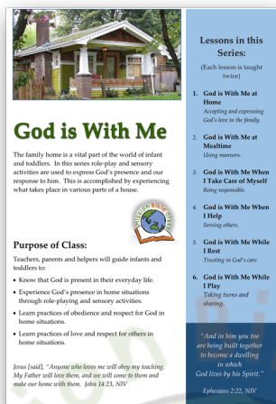
God is With Me (6 Lessons)