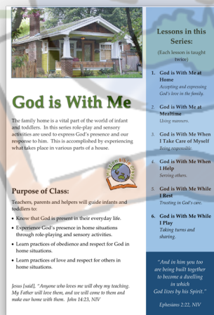
God is With Me (6 Lessons)