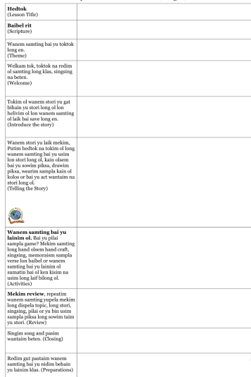
My Bible Class Planner (Pidgin)

©2011-2022 Mission Bible Class. Permission to use for personal or ministry purposes only. Not to be sold. www.missionbibleclass.org