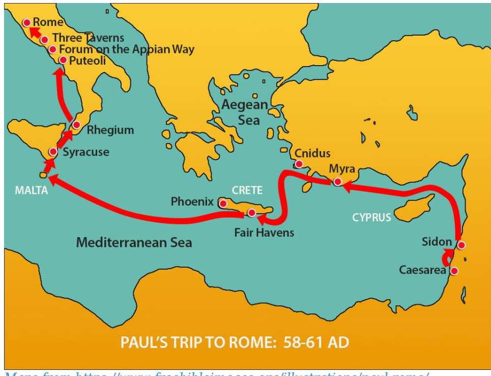
Maps from https://www.freebibleimages.org/illustrations/paul-rome/

Again, it is good to note the providence of God in protecting Paul as he made his way to Rome. Paul had been: