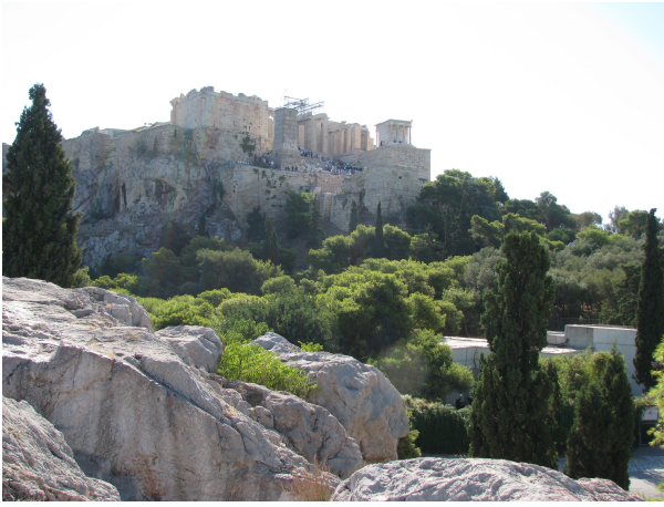
View of the Parthenon from the Areopagus

Athens was and is a city with many temples, altars, idols and statues. To an educated and conscientious Jewish teacher like Paul, this must have felt like an attack on the sovereignty of God. The writer of Acts says that “...he was greatly distressed to see that the city was full of idols.” Acts 17:16 ICB