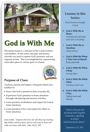
God is With Me (6 Lessons)