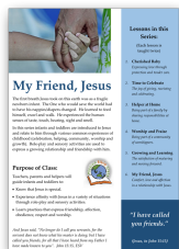
My Friend Jesus (6 Lessons)

Comfort, love and affection in a relationship with Jesus.