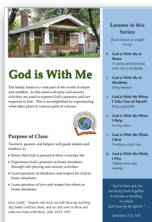
God is With Me (6 Lessons)