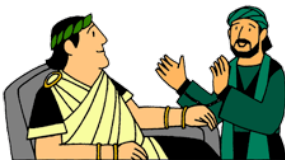
14: Paul on Trial