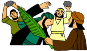
3: An Angry Crowd at Lystra