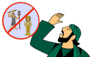
8: Paul Preaches in Athens-Mars Hill