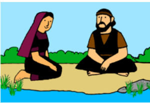
5: Lydia Becomes a Christian