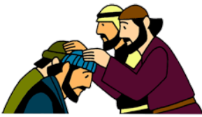
2: The Antioch Church