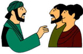
9: Priscilla and Aquila