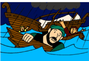
15: Paul Survives a Shipwreck