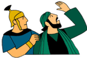
12: Paul Goes to Jerusalem