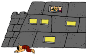
11: Eutychus Falls from a Window