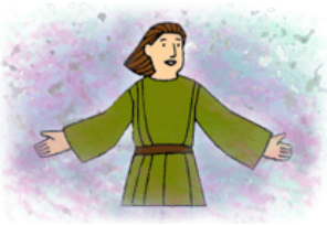
4: Macedonian Vision