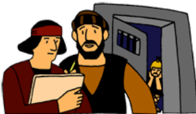
13: Paul's Nephew Uncovers a Plot