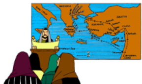
7: The Noble Bereans