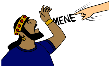
Writing on the Wall