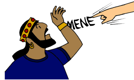
Writing on the Wall