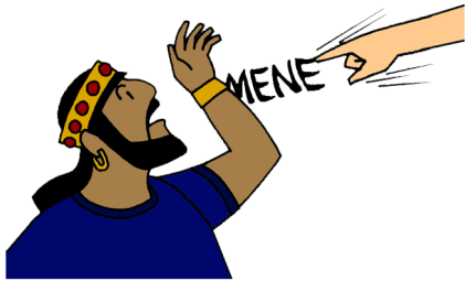
Writing on the Wall