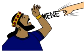
Writing on the Wall