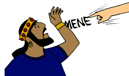
Writing on the Wall