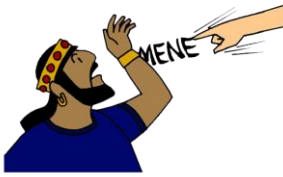
Writing on the Wall