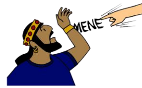
Writing on the Wall