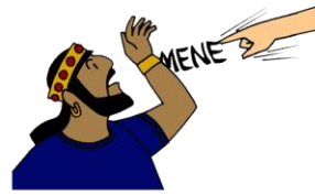
Writing on the Wall