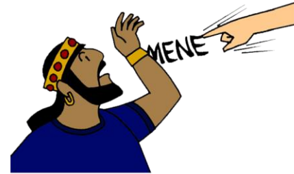
Writing on the Wall