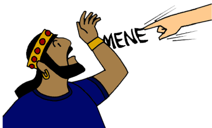
Writing on the Wall