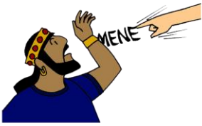
Writing on the Wall

Print this page on thick paper and then cut bookmarks apart. Use the bookmarks to mark places in Bibles so that children can read aloud. Have children write the Scripture reference for the story or copy a verse. For class review you might have children write notes or jot down important words in the story. For more teaching ideas visit www.missionbibleclass.org