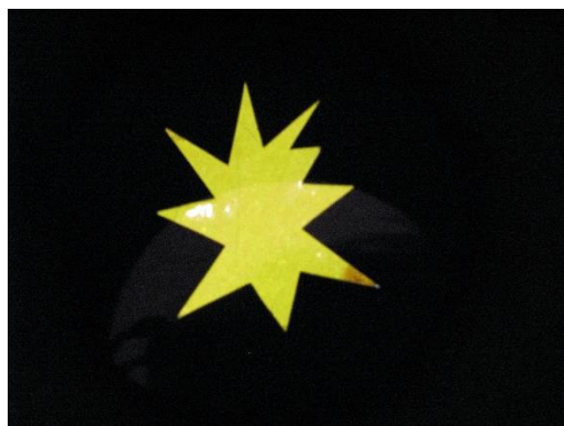
Cut-out of light at end of viewing tube.