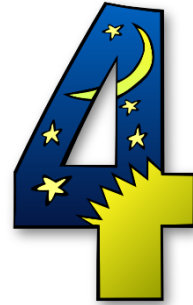
God made sun, moon, stars on the 4 th day.