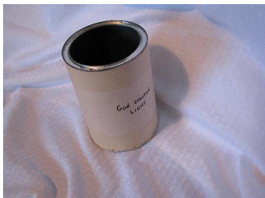
Viewing Tube. Large tin lined with black paper. Children look through to see light or stars at other end.