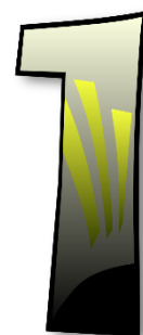
God made light on the first day.