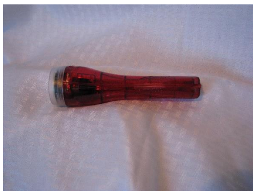
Torch/Flashlight. Turn this off and on for children to see light.