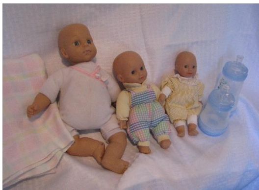
Dolls, bottles and blankets. Toddlers can rock and cuddle the dolls.