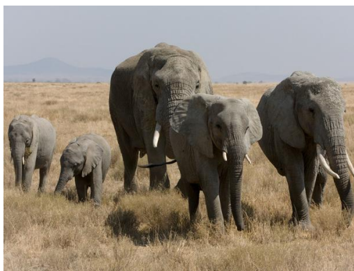
Animal families. Show pictures of animal families. Collect toy animals in sets of 3-4 so you can show parents and babies.