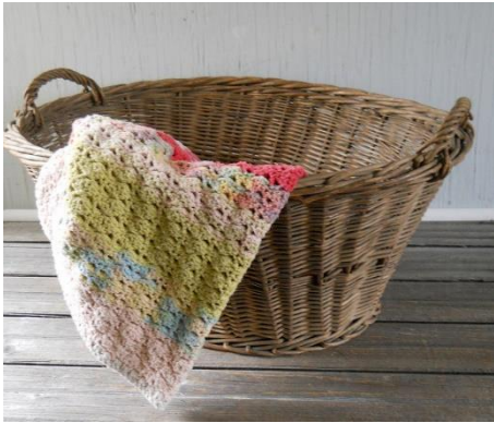
Laundry basket, a few clothes and small linen like washcloths.