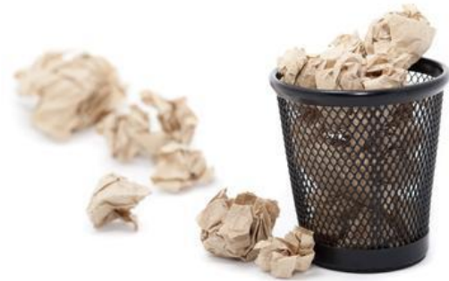
Wastepaper basket and crumpled paper.