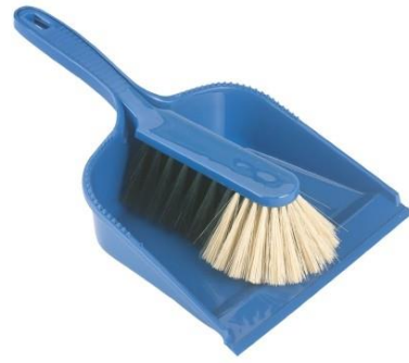
Dustpan and brush.