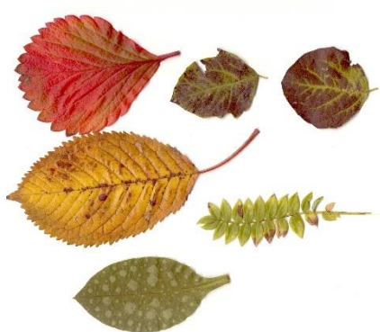
A collection of leaves and flowers of various colours, sizes and textures.