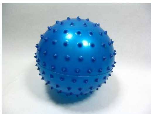
A ball soft enough to roll or kick around the room.