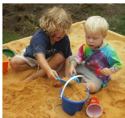
Sand and sand toys.