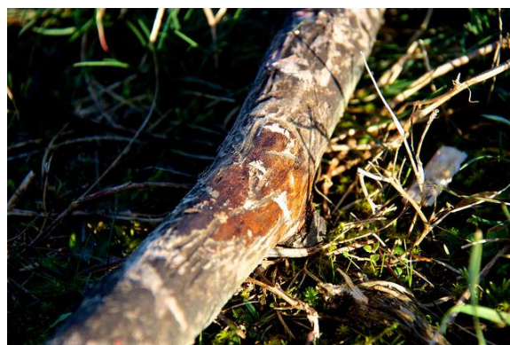
Sticks and other items you might see out in the garden. Check that there are no thorns or splinters.