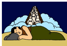
Jacob Goes to Haran