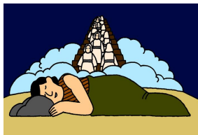
Jacob Goes to Haran