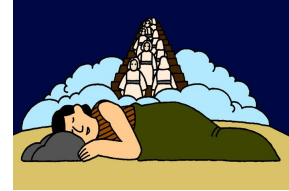
Jacob Goes to Haran