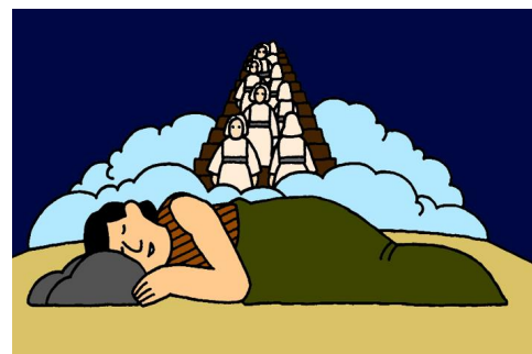
Jacob Goes to Haran