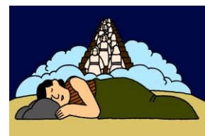
Jacob Goes to Haran