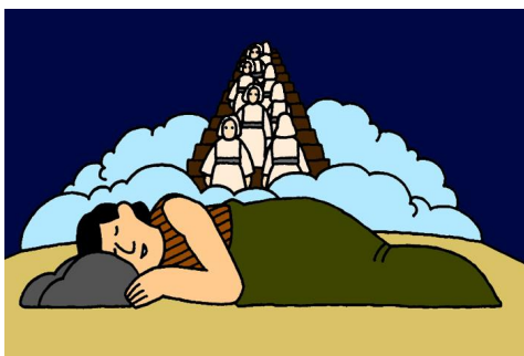
Jacob Goes to Haran