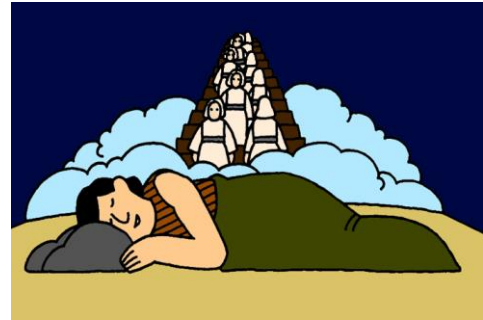
Jacob Goes to Haran