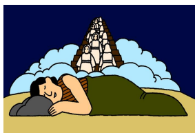
Jacob Goes to Haran