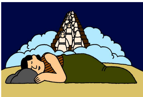
Jacob Goes to Haran