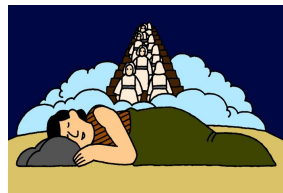
Jacob Goes to Haran