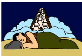
Jacob Goes to Haran