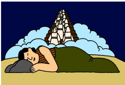
Jacob Goes to Haran