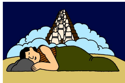
Jacob Goes to Haran