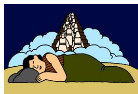
Jacob Goes to Haran