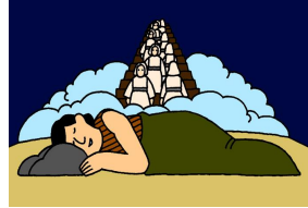
Jacob Goes to Haran