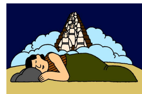
Jacob Goes to Haran