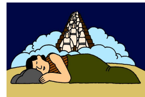
Jacob Goes to Haran