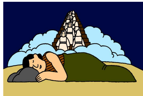
Jacob Goes to Haran