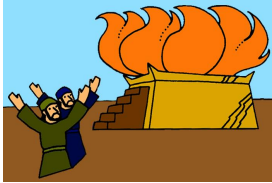
Nadab and Abihu