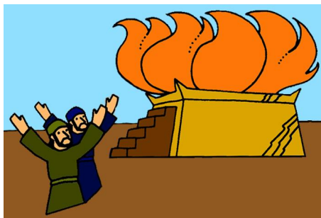
Nadab and Abihu