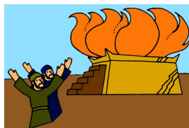
Nadab and Abihu