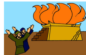
Nadab and Abihu