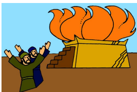
Nadab and Abihu