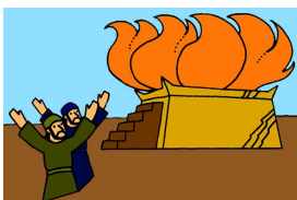
Nadab and Abihu