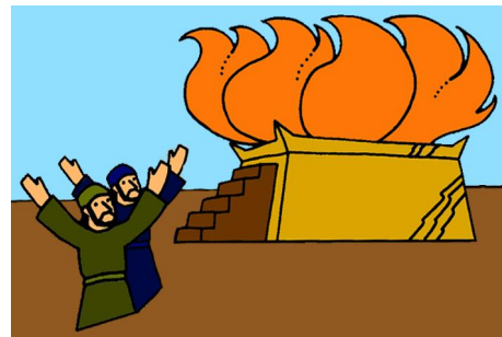
Nadab and Abihu