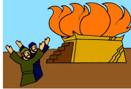
Nadab and Abihu