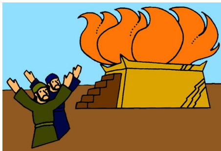
Nadab and Abihu