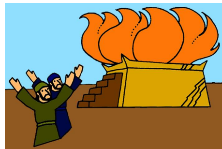
Nadab and Abihu