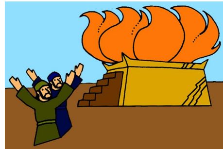
Nadab and Abihu