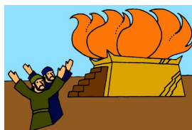
Nadab and Abihu