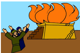
Nadab and Abihu