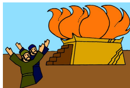
Nadab and Abihu