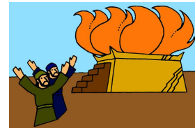
Nadab and Abihu