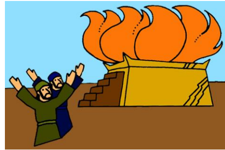
Nadab and Abihu