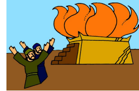
Nadab and Abihu