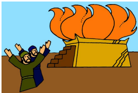
Nadab and Abihu