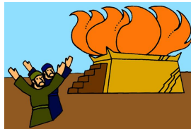
Nadab and Abihu