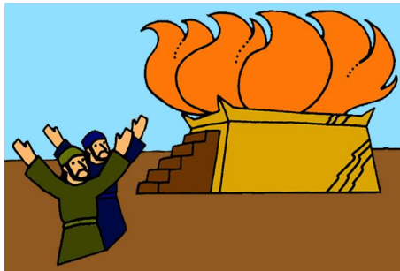
Nadab and Abihu