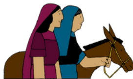
Ruth and Naomi