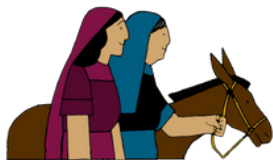
Ruth and Naomi