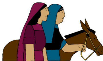
Ruth and Naomi