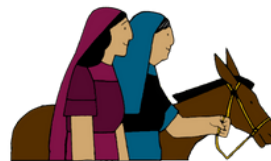
Ruth and Naomi