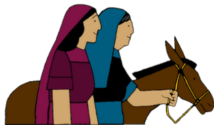
Ruth and Naomi