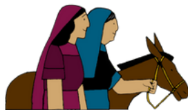
Ruth and Naomi