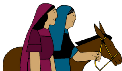
Ruth and Naomi