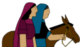
Ruth and Naomi