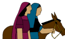
Ruth and Naomi