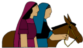
Ruth and Naomi