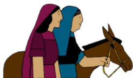
Ruth and Naomi