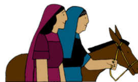
Ruth and Naomi