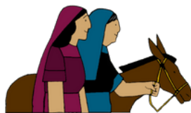
Ruth and Naomi