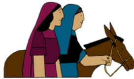
Ruth and Naomi