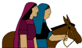
Ruth and Naomi